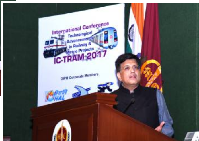
Sh Piyush Goel, Minister for Railways, delivering the Keynote Address at IC-TRAM 2017