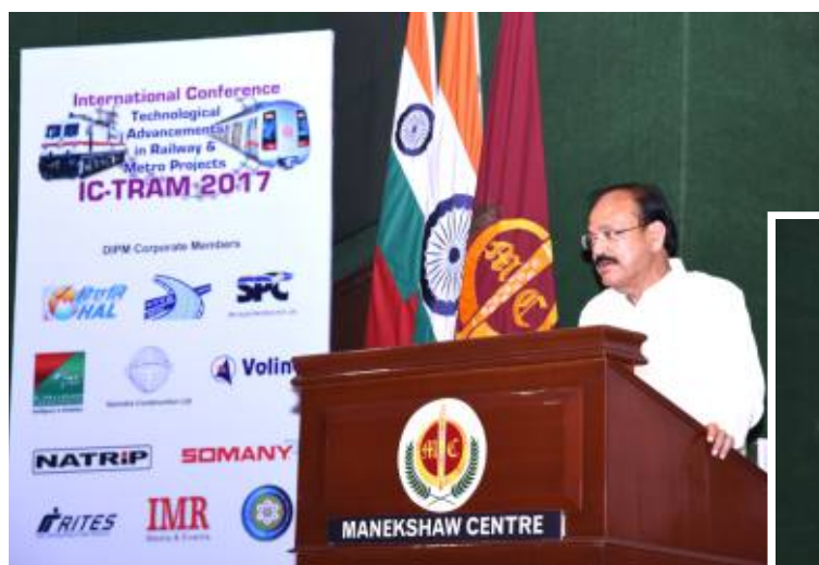
Sh M Venkaiah Naidu, Vice President of India, delivering the Inaugural Address at IC-TRAM 2017